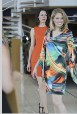
fashion show production