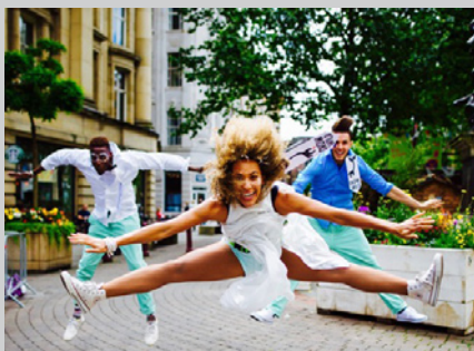
flash mob dancers