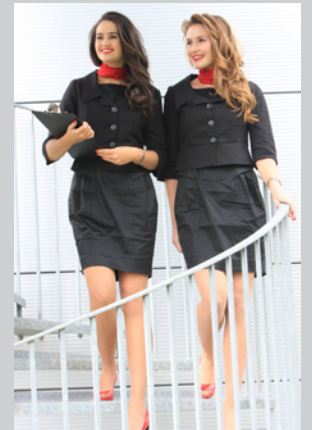
airport check – in